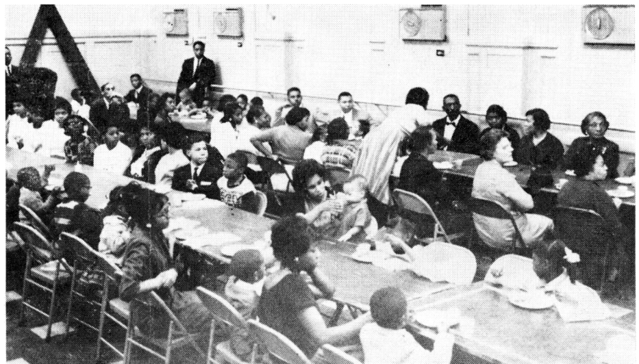
On Sunday, December 23rd, an old-fashioned family social was held for the colored brethren of Chicago. A treat and delight for all: dancing, food, singing, basketball, and games.

The habit of going to the bottom of things usually lands a man on top.